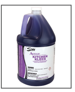
Avance<sup>™</sup> Kitchen Kleen ???